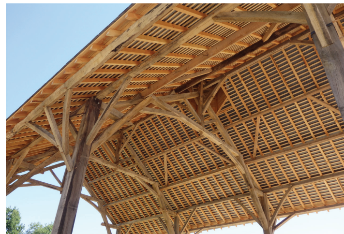
Communal hangar and atelier built at the zad.

This was, in other words, a full dismantling under the Commune of socially determined and ancient categories of artistic practices that began by proclaiming the value of artisanal work and decorative art. Shoemaker Napoleon Gaillard, or rather artiste-chaussurier Gaillard, as he insisted on calling himself, reinvents himself as barricade strategist and architect, constructing both a knowledge and an art of street defense, just as he performed in his trade a knowledge and an art of the shoe. Anti-communards called Gaillard a “vain shoemaker,” spoke contemptuously of him as the “père des barricades,” and nicknamed the enormous barricade he had constructed on the Place de la Concorde “the Chateau Gaillard.” They complained that he considered his barricades “works of both art and luxury.” As indeed he did, arranging to have himself photographed in front of his creations—in effect, signing them. Communal luxury as practiced during the Commune (or on the zad) is thus a way of constituting an everyday aesthetics of process, the act of self-emancipation made visible.