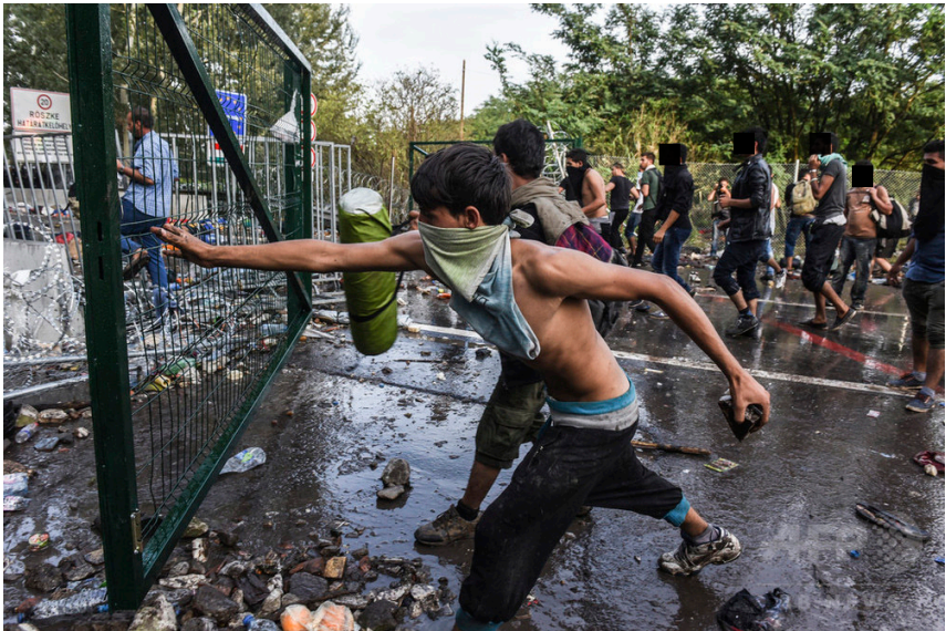
Migrants riot at the Hungarian border, 09/2015