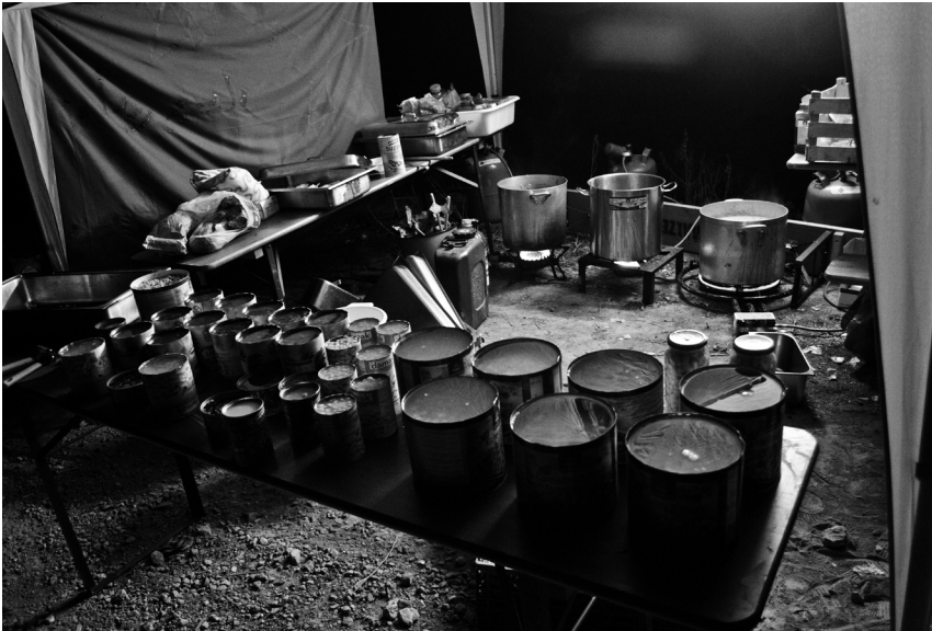
The autonomous kitchen

get inside the camp and before we knew it we were in the strange position of being the main providers of basic supplies to people inside. People were very very hungry. After setting up our kitchen immediately outside the camp and giving food to people who were standing for hours in queues waiting to get in, we began to take food and water to the perimeter fences of the camp where people were waiting for the buses to get out. Then we began jumping over the fences to take food in. Then we tried just walking in. I think the combination of the chaos of the situation and having high-visibility vests to make us look official is what allowed us to get inside and continue to get in for days. From my perspective, this quickly became an ambiguous situation. On the one hand it was good that we could bring basic supplies in and get food to people who hadn't eaten in days. But on the other hand it was uncomfortable to suddenly be working within the camp structure, in the role of providing basic human assistance inside a prison-camp, and in some way easing the situation for the charities and the cops in their miserable combination of overwhelmed and neglectful/racist prison guards.