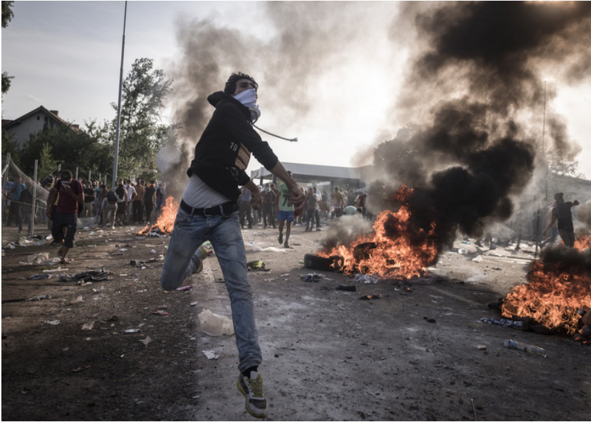
Riot at the Hungarian border in mid-September, 2015