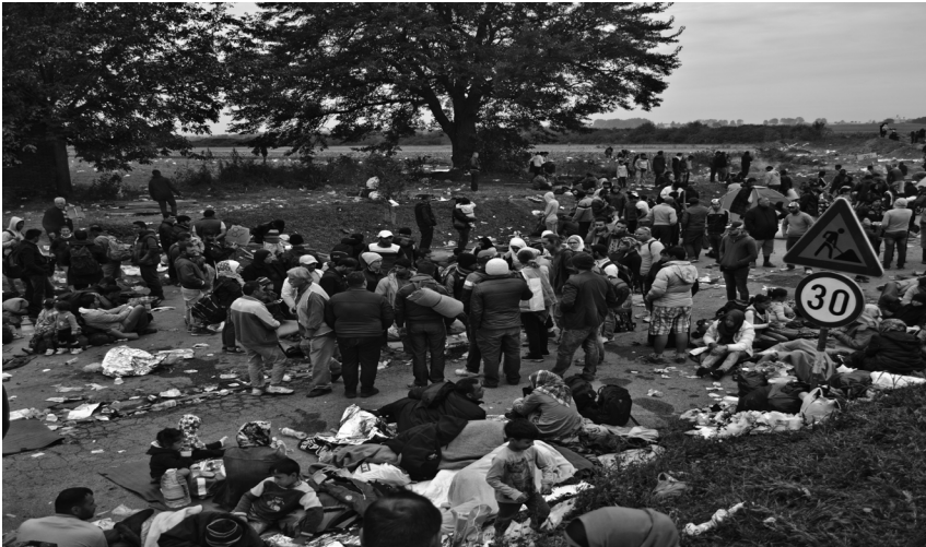
Stuck in the no-mans land between the Serbian and Croatian borders

military tents were full. It was also a state attempt to control the flow of people, restrict their freedom of movement, isolate them, and channel them into the camp and out of the world's sight, and out of the country as fast as possible. Because the buses would only arrive infrequently, and a continuous flow of sometimes up to 10 000 would arrive here every day, thousands of people would build up in the no-mans land. Our kitchen and another group giving out cold food were the only ones providing food where people would get stuck for days out in the open.