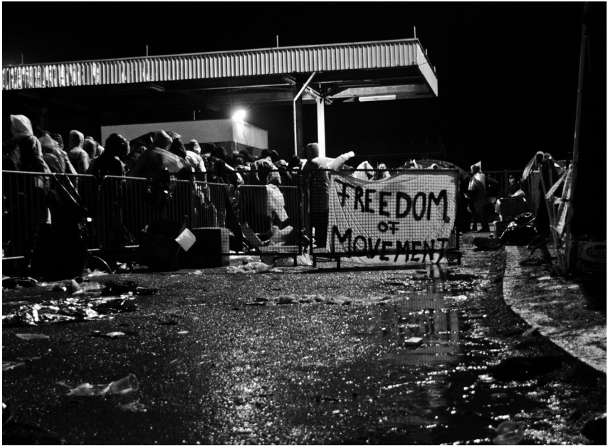
Waiting to get inside the camp

The camp at Opatovac is a former military camp, hastily constructed into a refugee prison and surrounded by high fences. It was run by the military and police, with some minimal Red Cross, Unicef and UNHCR presence, who basically were just assisting the cops. It held military tents for sleeping, some medical tents, some toilets and that was about it. People slept on the ground and blanket and water distribution by the Red Cross was rare. Several times I would see groups of Red Cross workers standing around smoking next to piles of blankets or water, when I told them that the people inside were desperate for these things they would make some excuse about why they weren't distributing them. "They will only be here for a few hours and will make the blankets dirty". People were stuck here for days. "They have access to water inside". People were made to queue for many hours in order to move into the next zone in the camp, and couldn't leave these queues to access the water supply.