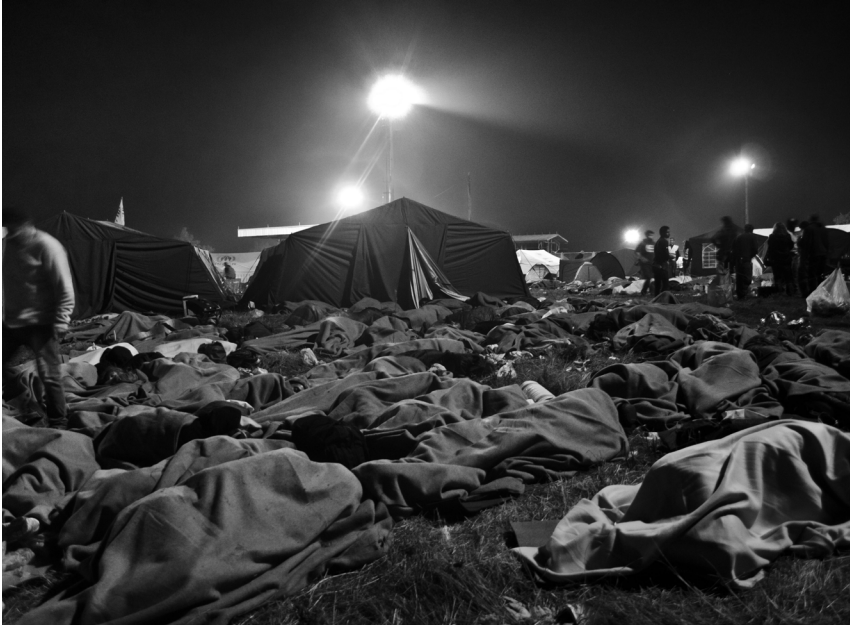
People sleeping outside the camp

In the days I was there, I saw food being distributed once by the Red Cross (bananas and tins of fish). I heard that in another camp they stopped distributing the tins of fish because people were throwing them at the police. The camp had a capacity for approx. 3000 people, but sometimes would be holding up to 5000 people, with many setting up camp outside as well. If people wanted to get on one of the buses taking them to the next border, they were forced to go through this camp. After being dropped here in buses and crammed into police vans normally used for arrestees, the police would direct them into the queue to get into the camp, and stop them from trying to make their own way.