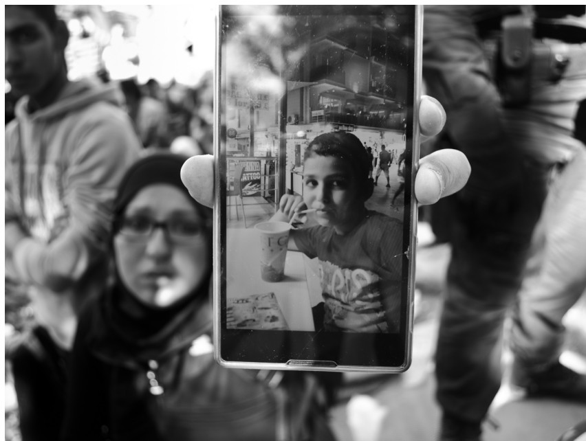
A woman trying to find her lost children

Of all the horrible shit I saw happen that week, the separating of families was the worst. Families traveling together seemed to form very strong support networks. At this point each other is all they have. Many of the walkers didn't know where they were or that they were being forced into the transit camp. Before entering the camp some were able to find each other again, but many didn't, and once inside it was difficult, as people were separated into different zones.