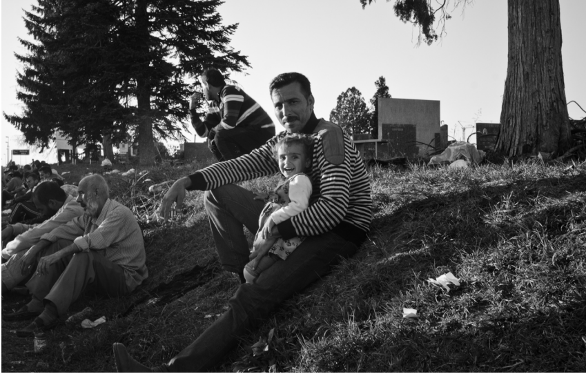
Father and daughter sitting besides the cemetery in the no-mans land

There are some clear causes to this situation: global capitalism, centuries of colonialism and Western imperialism, the West's instigation of and involvement in wars in the Middle East and Africa in its attempt to gain control over resources, regional conflict, racist asylum policies, racist borders, rising islamaphobia and fascism. We can also identify clear consequences: death, misery, and suffering. It is hard however to see an end to the misery and trauma. People are fleeing the atrocities of war and when they finally arrive on European shores, instead of finding some basic safety, of endurance being that much more possible, they find governments who criminalize them and are unable to coordinate an adequate political and humanitarian response, they find profiteering smugglers who give zero shits if they live or die, they are left in the hands of violent fascist thugs in uniforms, they find camps which, in the refugees' own words, are prisons where they are treated like animals. The misery doesn't end after the 17 km walk at night in the rain to the camp. It doesn't end when they arrive at the camp, and it doesn't end when they finally get on a bus to the next border. And nor does it end when they arrive