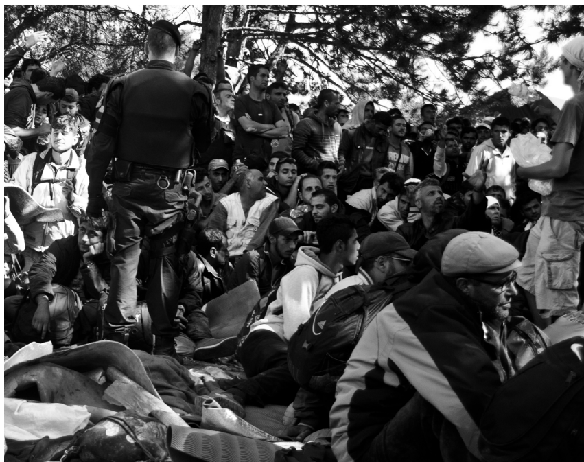
Crowds waiting to get out of the camp

people in response. Children getting injured from tear-gas. Cops smirking in the faces of a young distraught couple who they were not letting through to another zone in the camp in order to try and find their family from whom they had been separated. A cop hitting a young boy. The many sick and injured people not getting medical attention.